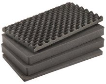
1555AirFS 4 pc. Replacement Foam Set